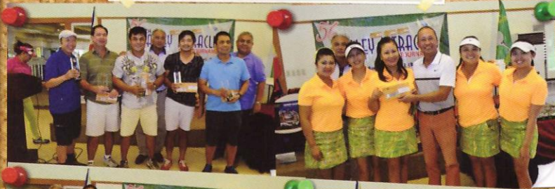
56TH INTRACLUB, November 15 & 21, 2015