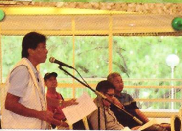
ANNUAL STOCKHOLDERS' MEETING, September 27, 2015