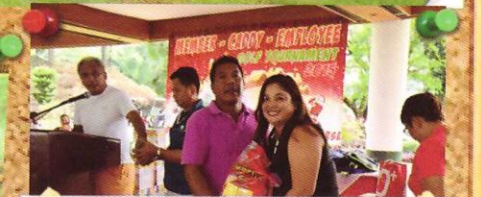
MEMBER-CADDY-EMPLOYEE GOLF TOURNAMENT, December 13, 2015