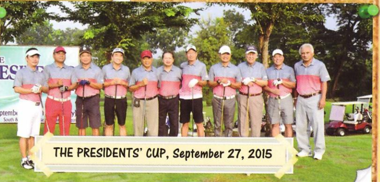
THE PRESIDENTS' CUP, September 27, 2015