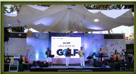
18th Don Celso Tuason & Founders' Cup