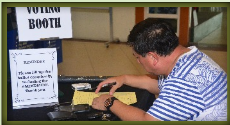
Stockholders' Meeting & Election